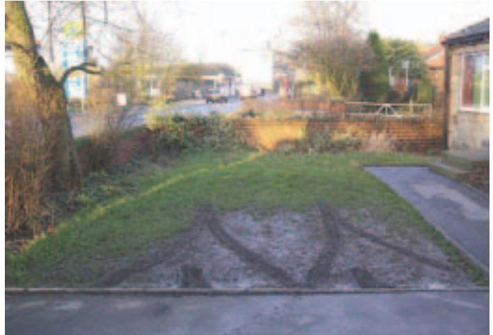
Problem parking area?