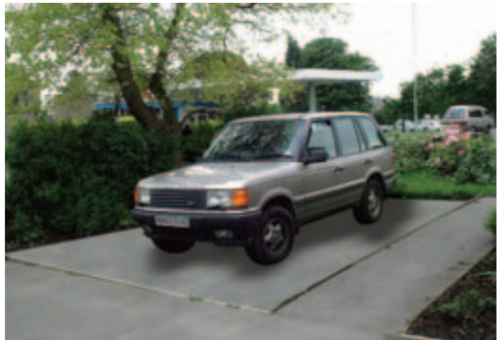
The old solution