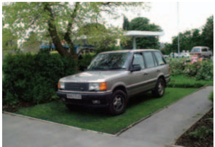
The Ecoblock solution